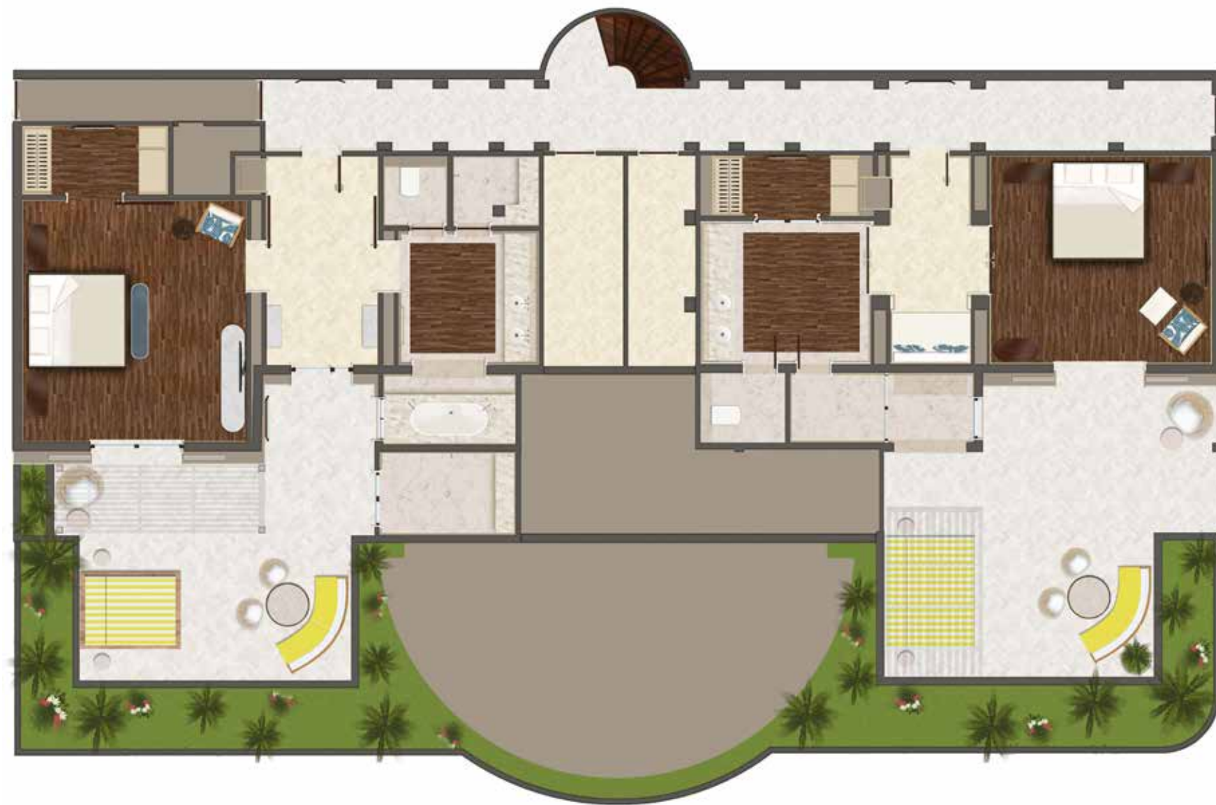
Overlooking the bay of Gustavia