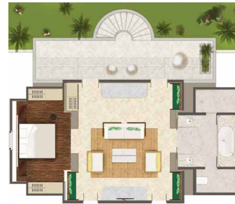
Overlooking the bay of Gustavia